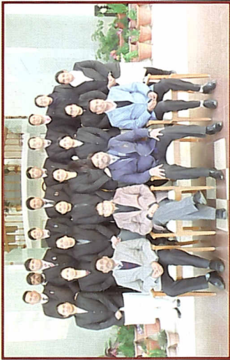
Foundation Training Programme for Newly recruited Civil Judges (J.D), 2014 Batch (IInd Phase of Institutional Training