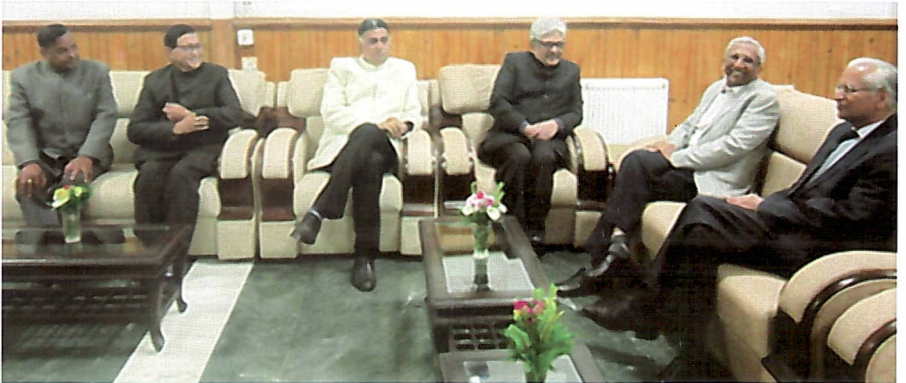
Hon'ble Mr. Justice Adarsh Kumar Goyal, Judge Supreme Court of India with Hon'ble the Chief Justice & Hon'ble Judges of High Court during his visit to Nainital