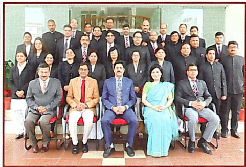
Workshop on Animal Protection Laws & Animal Welfare Laws from 25-26 August 2017 ( 2<sup>nd</sup> Phase)