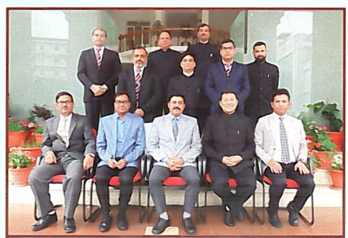
Training Programme on UBUNTU Operating System for Judicial Officers cum Master Trainers from 18-19 September 2017