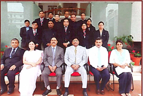
Workshop on Animal Protection Laws & Animal Welfare Laws from 25-26 August 2017 (1st Phase)