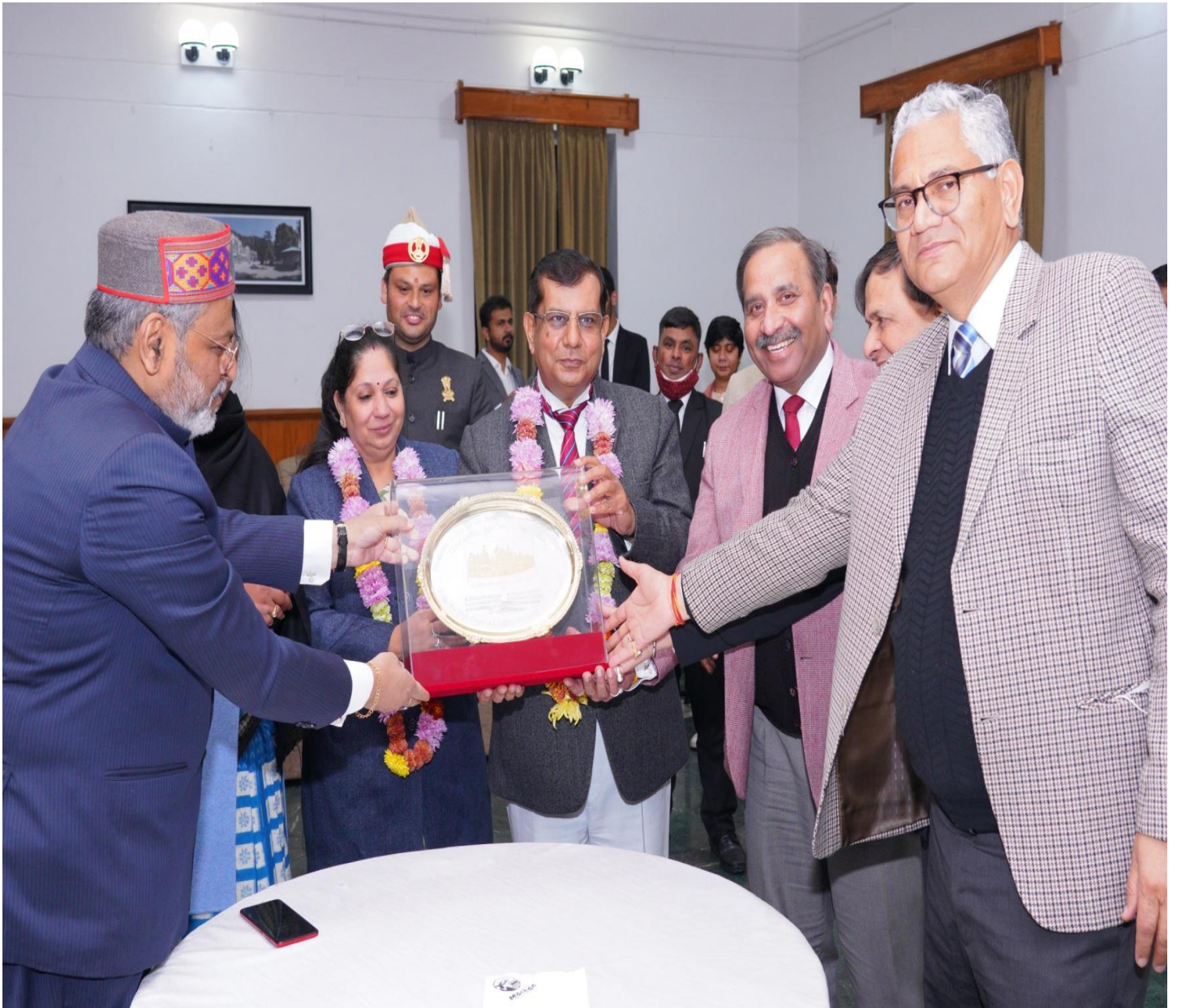
Hon'ble Judges presenting memento to Hon'ble Mr. Justice Raghendra Singh Chauhan, Chief Justice of High Court of Uttarakhand on the occasion of superannuation of Hon'ble the Chief Justice.