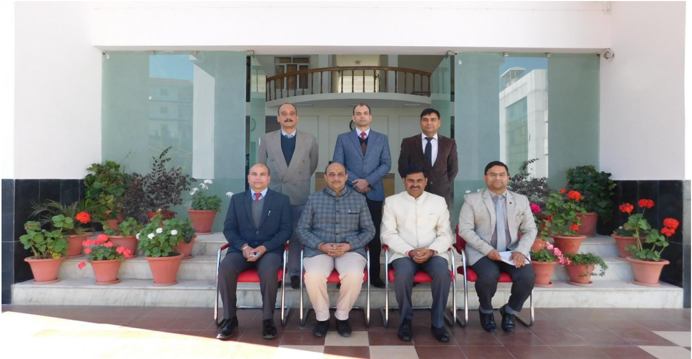
Capsule Course for Judge Advocate Officers of Indian Air Force (Physical Mode) from the period 07.12.2021 to 11.12.2021