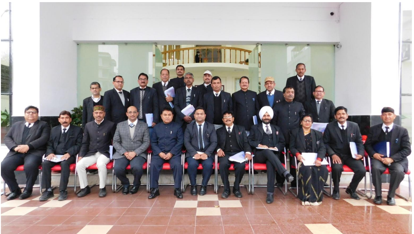
Training Programme for DGCs and ADGCs (Civil) on Civil laws (Physical Mode) from the period 01.12.2021 to 02.12.2021