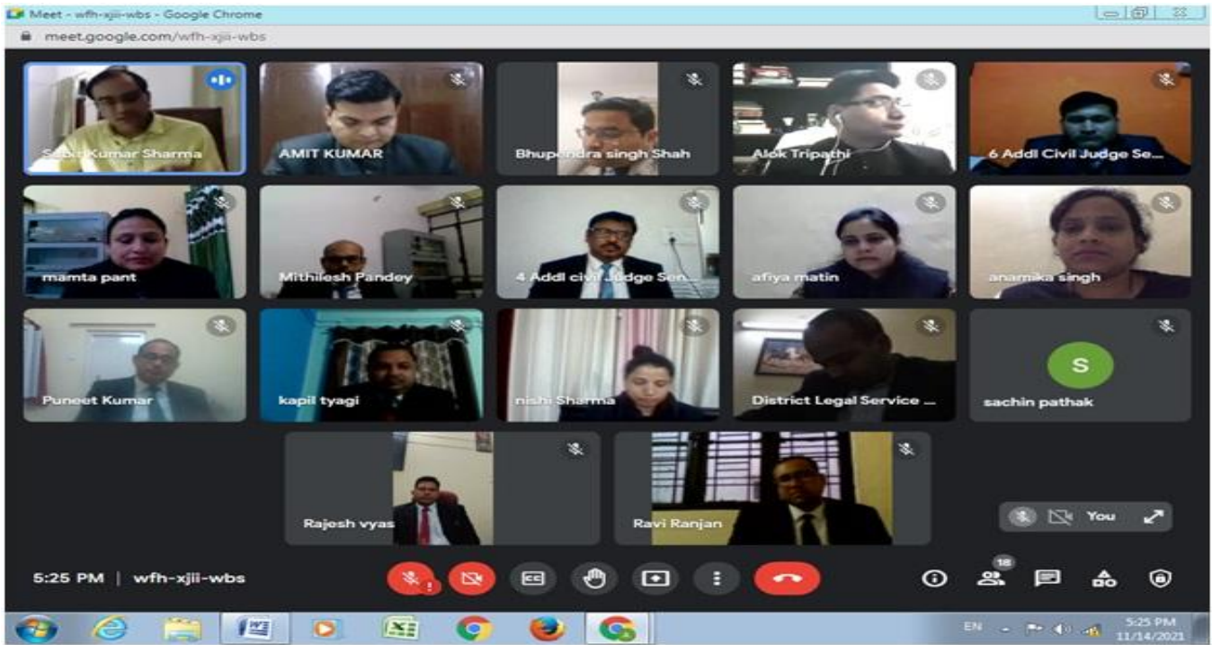
Training Programme for recently promoted Judges in Civil Judge (Sr. Div.) Cadre (Virtual Mode) from the period 10.11.2021 to 21.11.2021