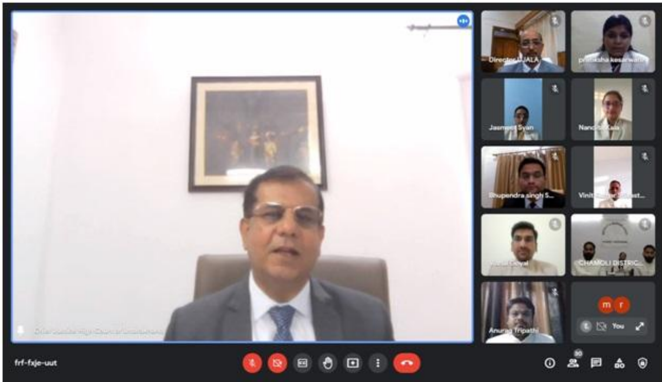
Foundation Training Programme for Newly Recruited Civil Judges (J.D.), 2018 Batch (Queries resolving phase of Institutional Training) (Virtual Mode) from the period 24.09.2021 to 09.10.2021