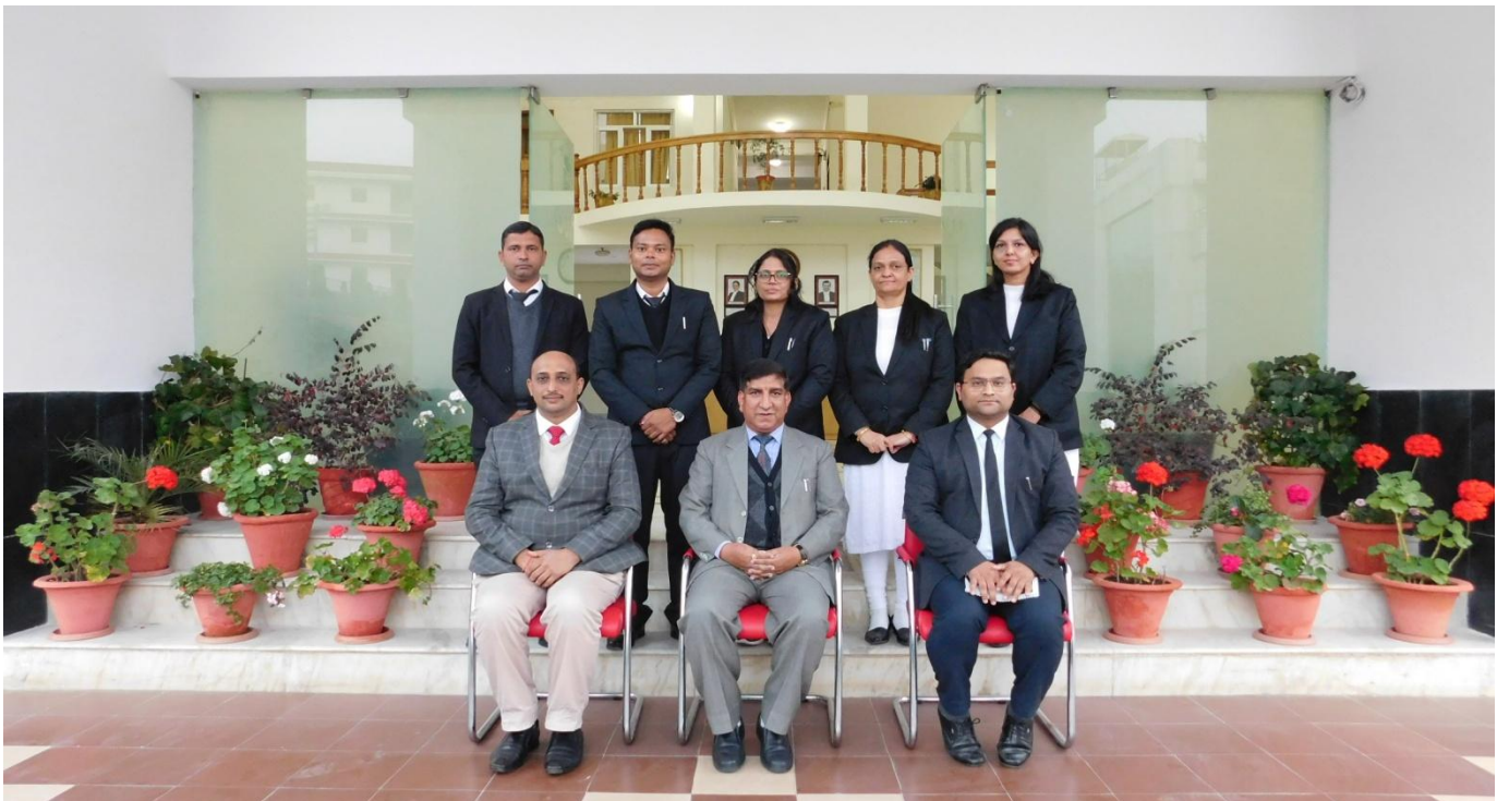
Foundation Training Programme for Assistant Prosecution Officers (APOs) in the waiting list of the State (Physical Mode) from the period 25.11.2021 to 24.12.2021