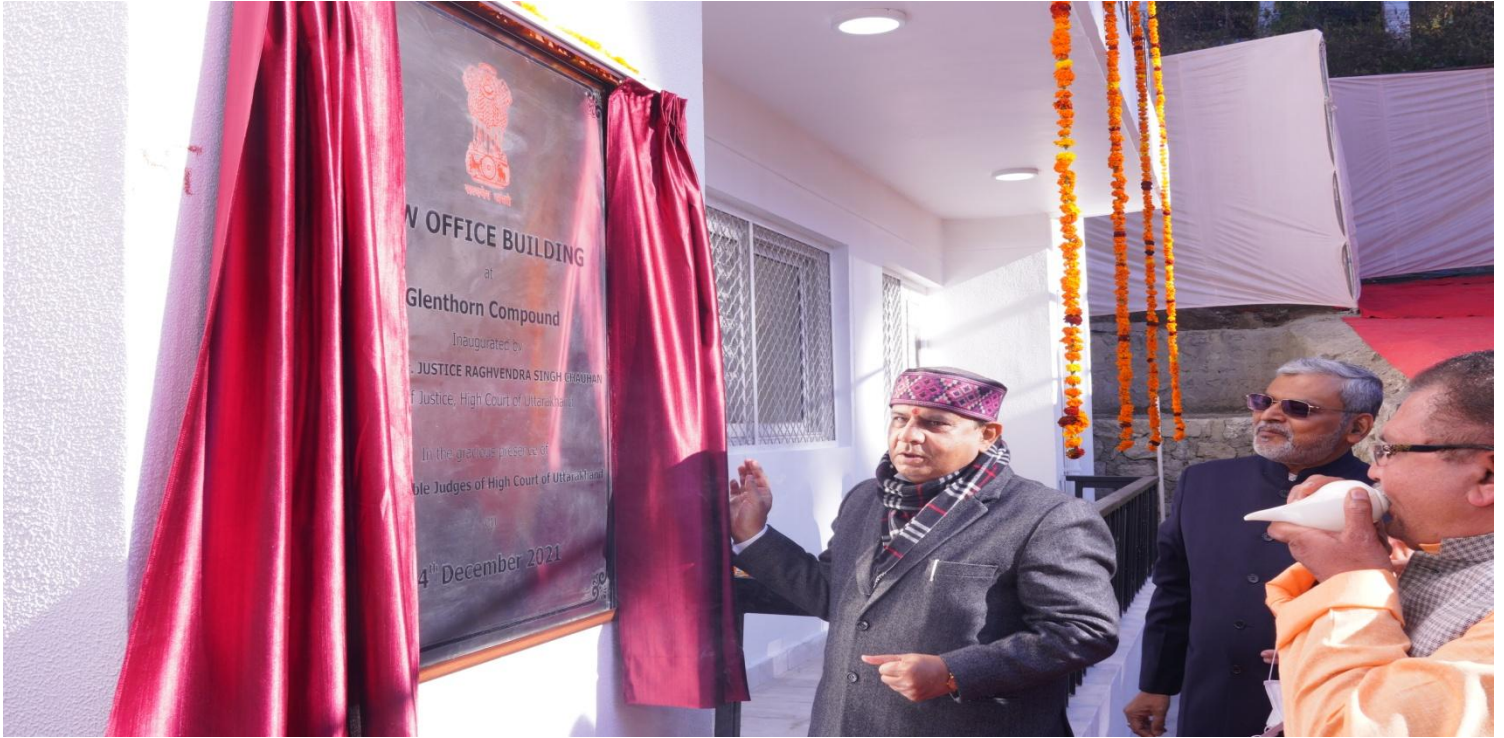
Inauguration of New office Building at Glanthorn Compound by Hon'ble the Chief Justice along with Hon'ble Judges of the High Court on 14.12.2021