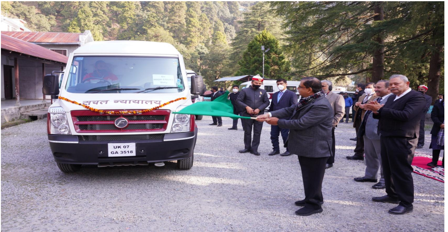
Mobile Vans for 'Sachal Nyayalay' launched by Hon'ble the Chief Justice in the presence of Hon'ble Judges of High Court on 16.12.2021.