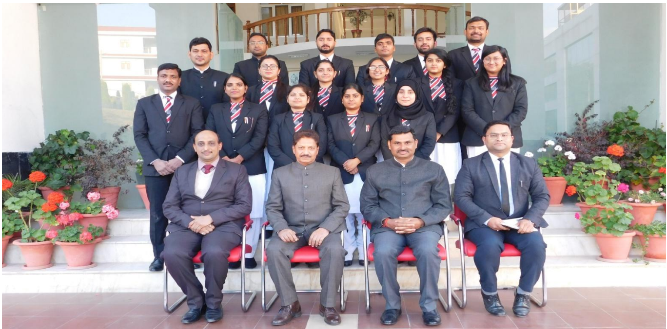
Foundation Training Programme for Newly Recruited Civil Judges (J.D.), 2019 Batch (1 st phase) (Physical Mode) from the period 01.09.2021 to 15.11.2021