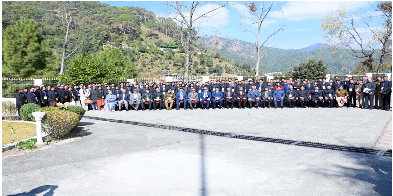
Judicial Conference on Human Trafficking, Gender Justice and Upliftment of Weaker Section of Society (Hybrid mode) from 19.11.2022 to 20.11.2022