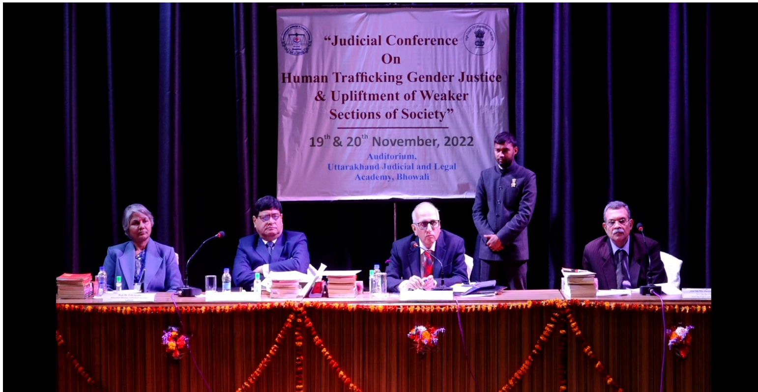
Judicial Conference on Human Trafficking, Gender Justice and Upliftment of Weaker Section of Society (Hybrid mode) from 19.11.2022 to 20.11.2022