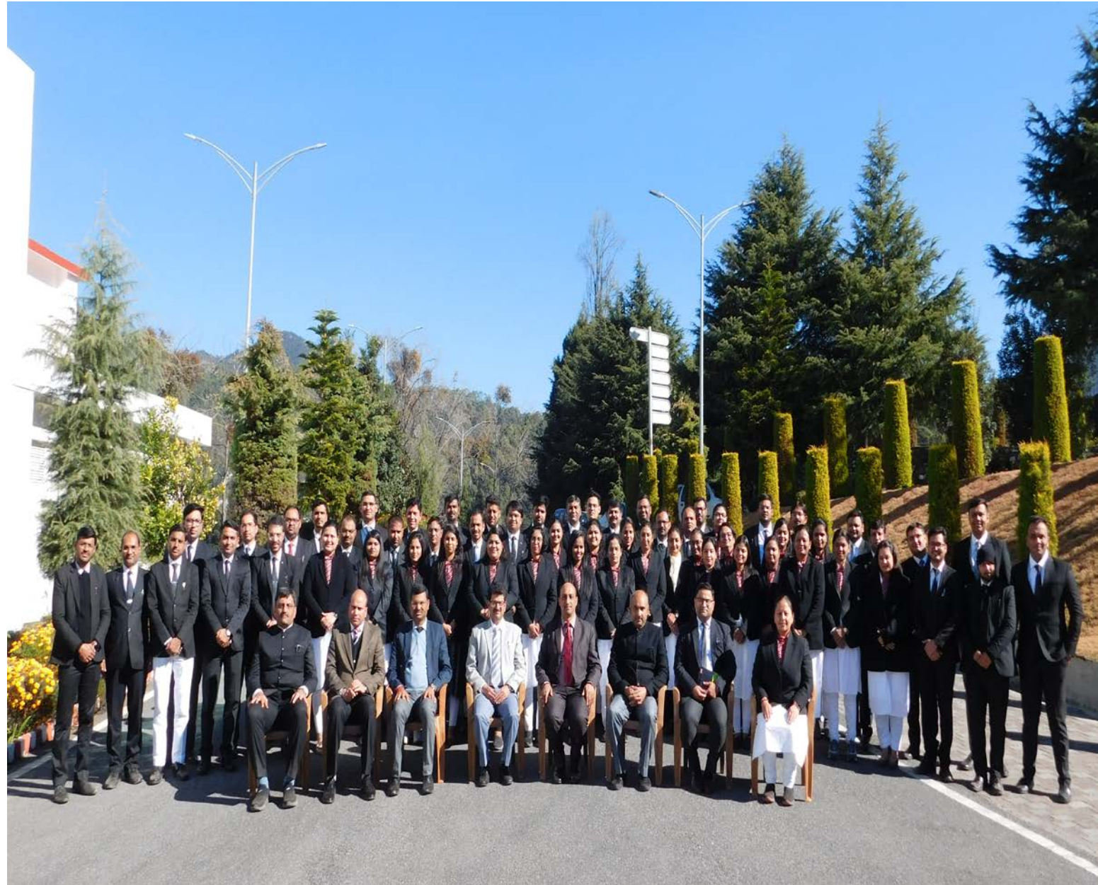
Knowledge Exchange (Excursion) Programme for newly recruited Judicial Officers in the cadre of Civil Judge and Judicial Magistrate First Class (Batch 2021) of Gujarat State (Physical Mode) from 12.12.2022 to 17.12.2022