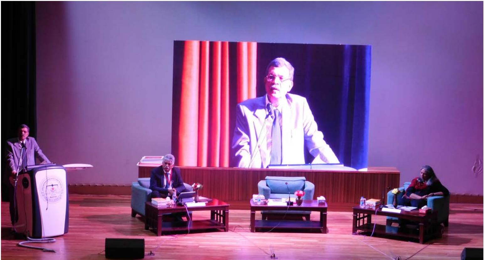
State Level Consultation on 'Children in Conflict with Law (CICL): Prevention, Restorative Justice, Diversion and Alternatives to Detention' on 13.08.2023.