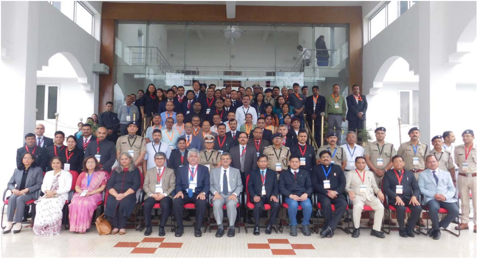
State Level Consultation on 'Children in Conflict with Law (CICL): Prevention, Restorative Justice, Diversion and Alternatives to Detention' on 13.08.2023.