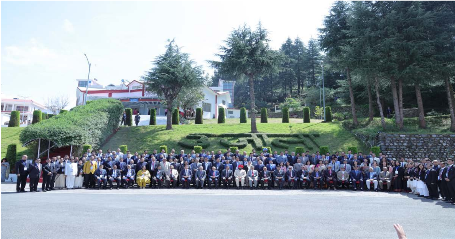
North Zone -1 Regional Conference on “Contemporary Judicial Developments and Strengthening Justice through Law and Technology” from 30.09.2023 to 01.10.2023