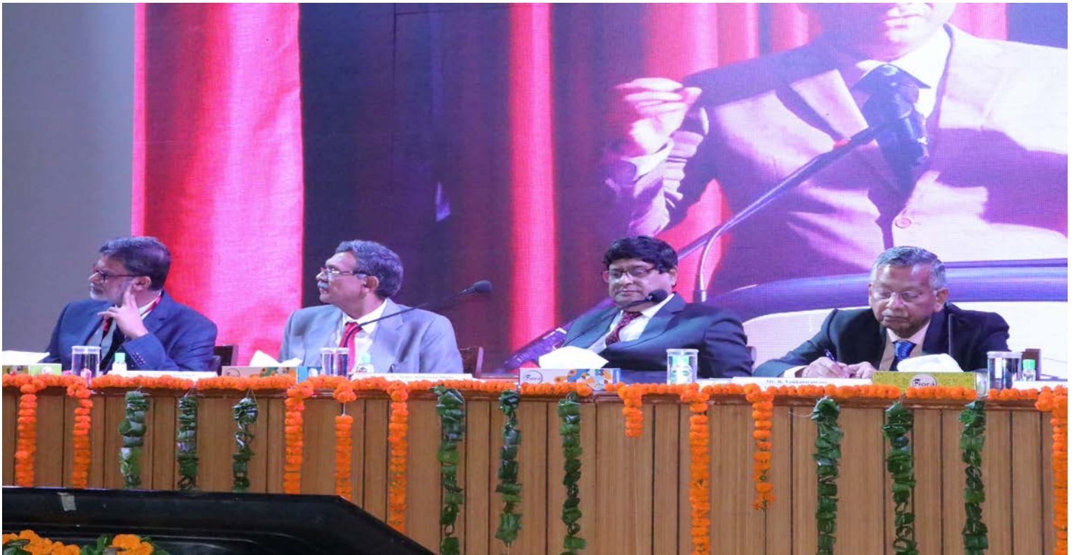
North Zone -1 Regional Conference on “Contemporary Judicial Developments and Strengthening Justice through Law and Technology” from 30.09.2023 to 01.10.2023