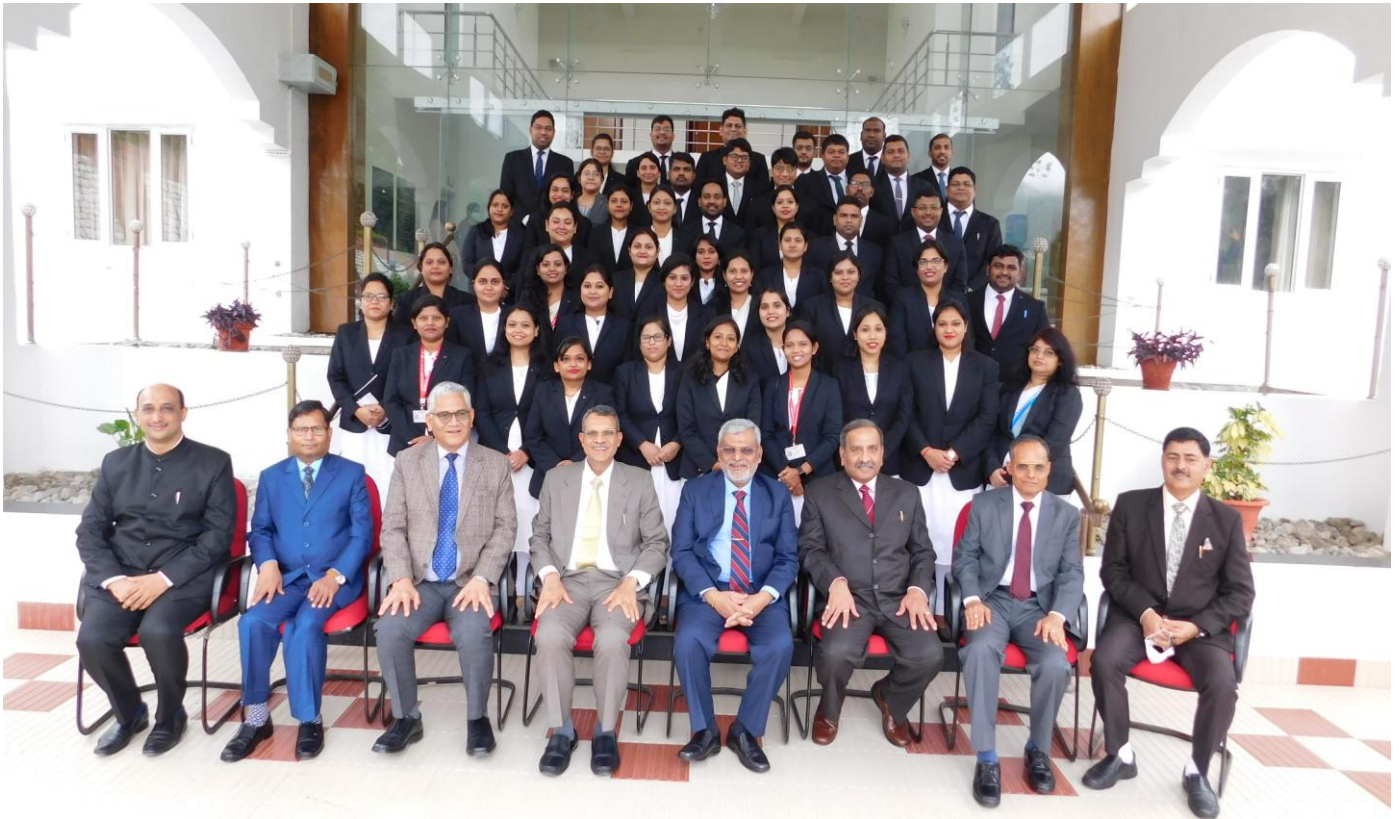
Sharing of Best Practices Programme for Civil Judges on Probation of 2019 Batch of Odisha Judicial Service from 24.07.2022 to 30.07.2022.