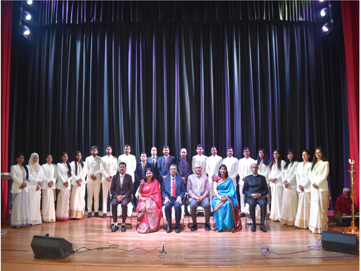
Foundation Training Programme for Newly Recruited Civil Judges (J.D), 2019 Batch (IIIrd phase of Institutional Training) from 01.07.2022 to 05.10.2022