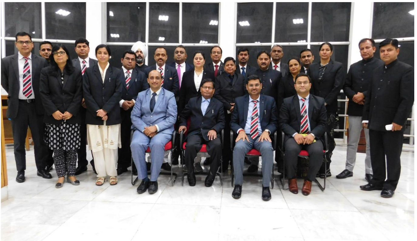
Workshop for Civil and Criminal Law relating to Appeals, Revision for ADJs (IInd phase) on 23 rd and 24 th of August, 2022