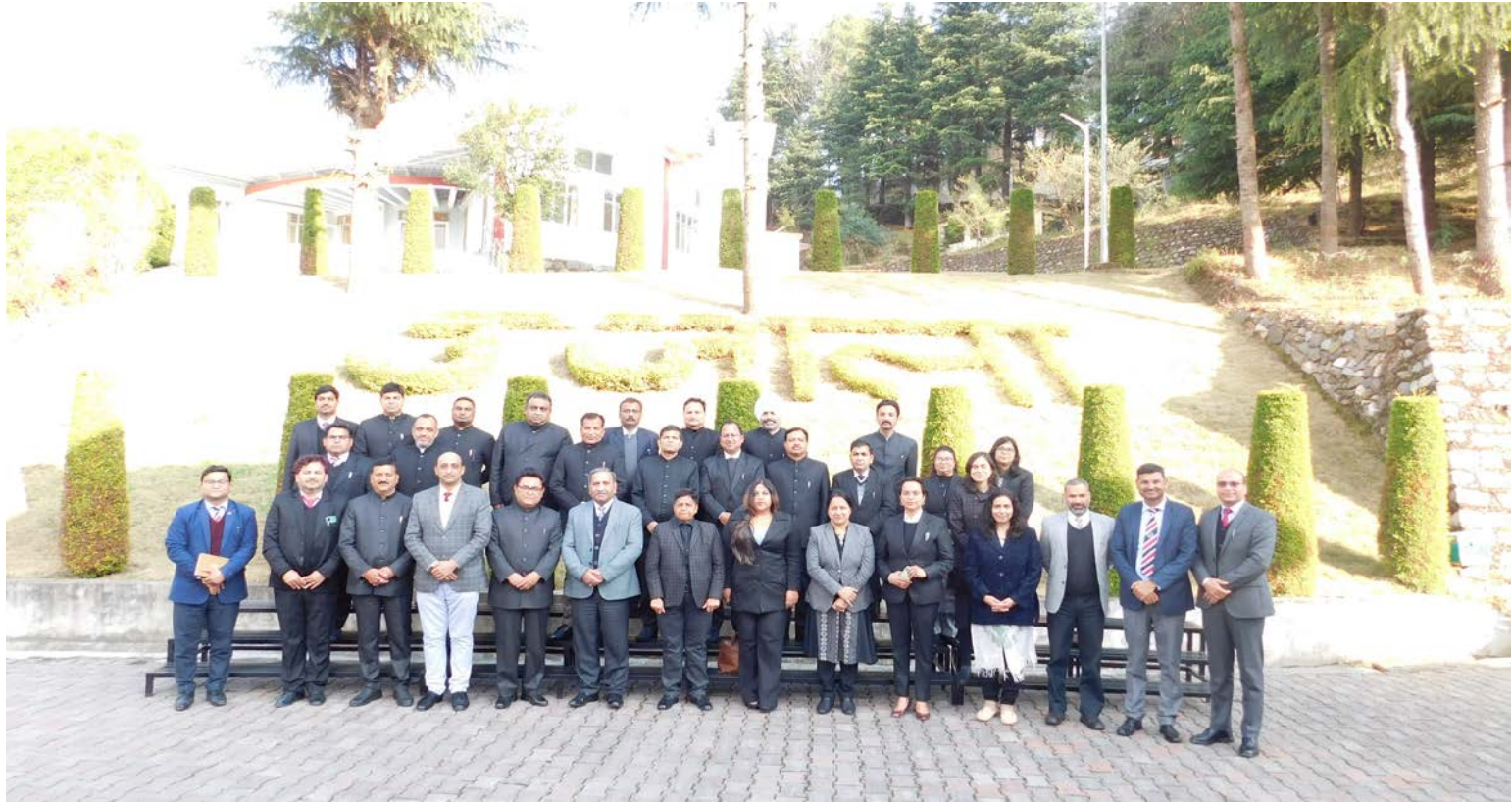
Training programme on Constitutional Law and Behavioural Management for HJS Cadre Officers (1 st phase) from 23.03.2023 to 24.03.2023