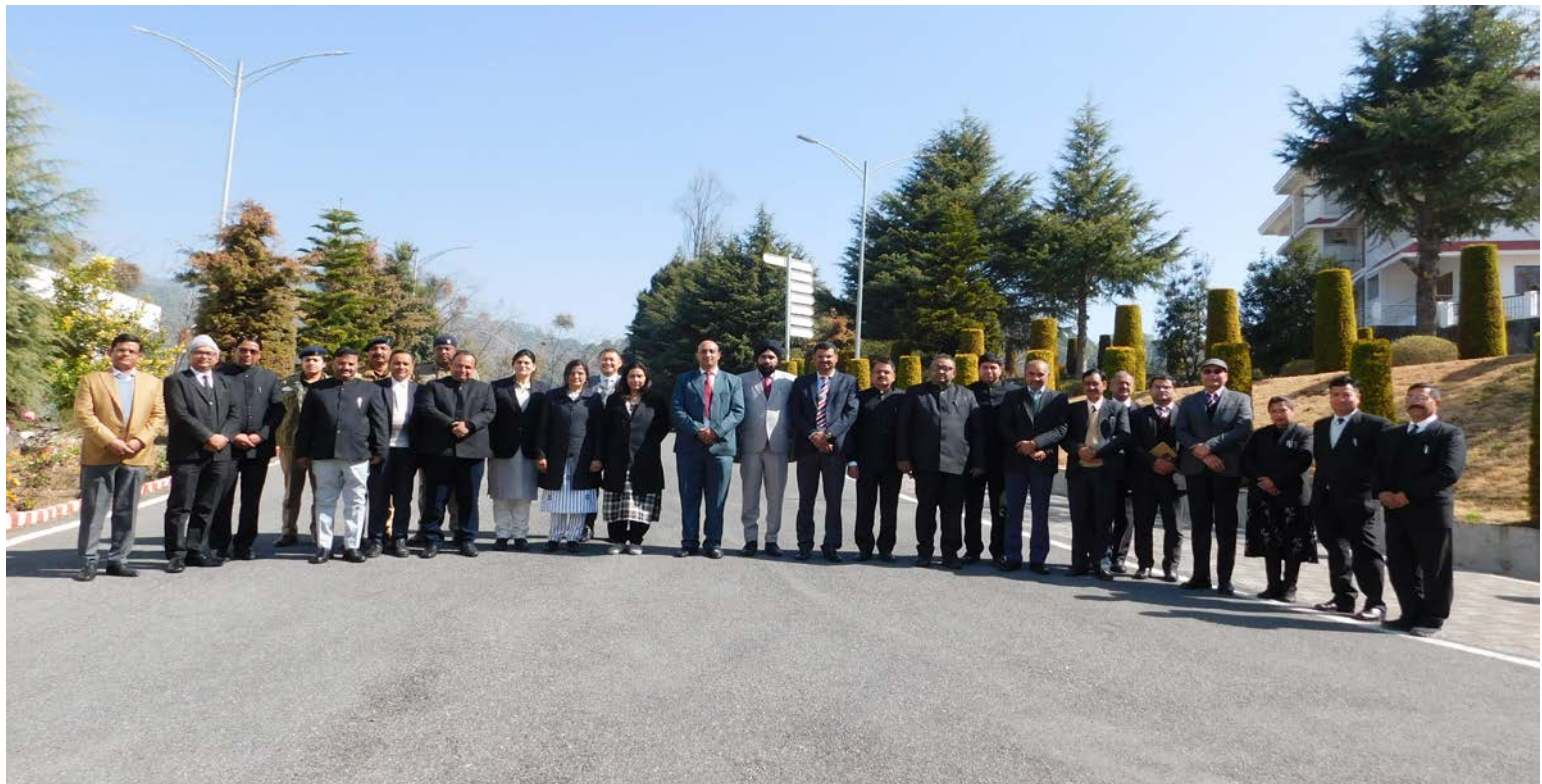
Joint Workshop on HJS, DSPs & DGCs/ADGCs (1 st Phase) from 14.02.2023 to 15.02.2023)