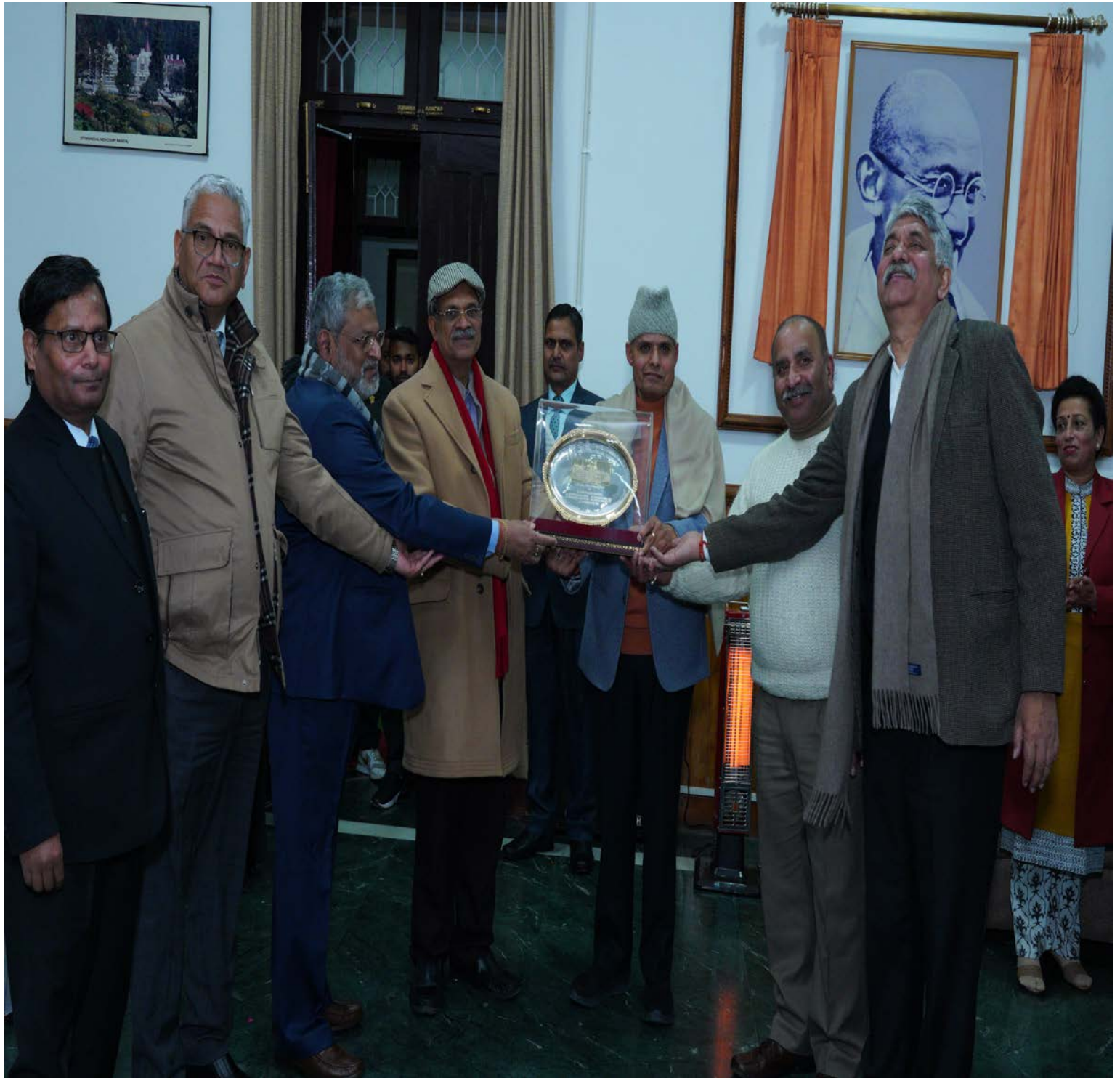
Hon'ble Judges presenting momento to Hon'ble Mr. Justice Ramesh Chandra Khulbe, Judge, High Court of Uttarakhand on the occasion of Superannuation of Hon'ble Mr. Justice Ramesh Chandra Khulbe.