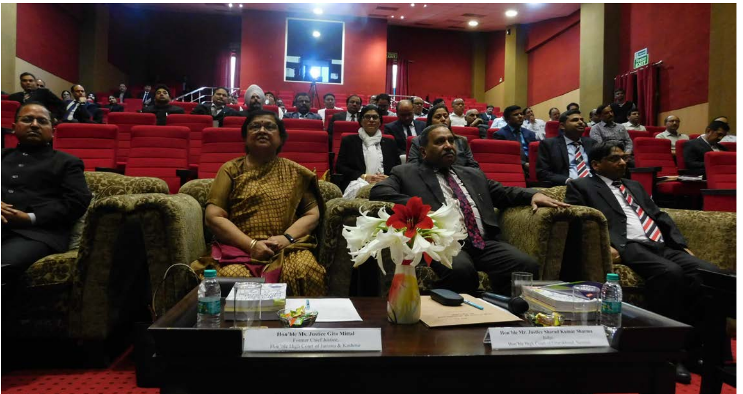
Training Programme on Vulnerable Deposition Centre (VWDC) (Hybrid Mode) on 21.05.2023