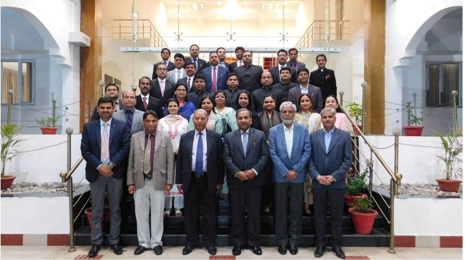
Induction Training Programme for Additional District Judges (Direct Recruits) of Uttar Pradesh from 08.05.2023 to 13.05.2023.