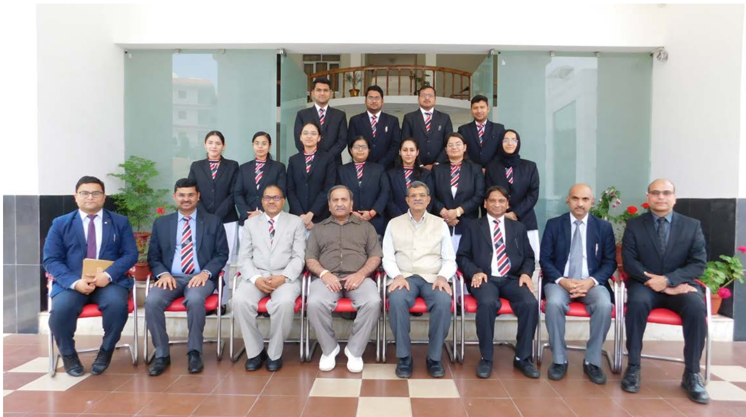
Foundation Training Programme for Direct recruited Judicial Officers in H.J.S cadre and newly Recruited Civil Judges (J.D.) 2021 Batch (1 st Phase of Institutional Training from 12.06.2023 to 11.09.2023 and 12.06.2023 to 27.08.2023.