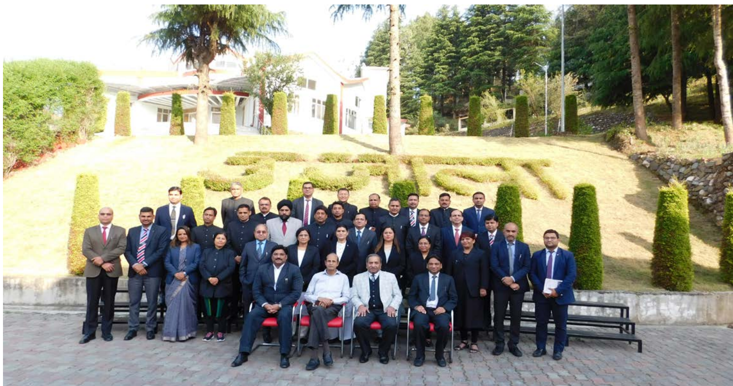
Training Programme on Constitutional Law and Behavioural Management for HJS Cadre Officers (IInd Phase) from 18.04.2023 to 19.04.2023